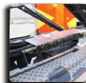
Fully Protected Chassis