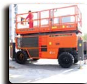
Automatic Leveling Outriggers