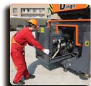
Slide-Out Engine Tray